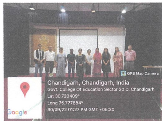
(Elected Committee Members and Faculty)